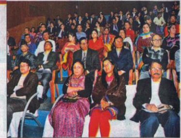
सीआईएमपी के स्थापना दिवस पर हुए कार्यक्रम में शामिल शिक्षक व छात्र-छात्राएं।

'द व्यूटीफुल माइंड' सीआईएमपी के छात्रों द्वारा संचालित कार्यक्रम है। इसमें स्लम परिया के बच्चों को सीआईएमपी के छात्र पढ़ाते हैं।