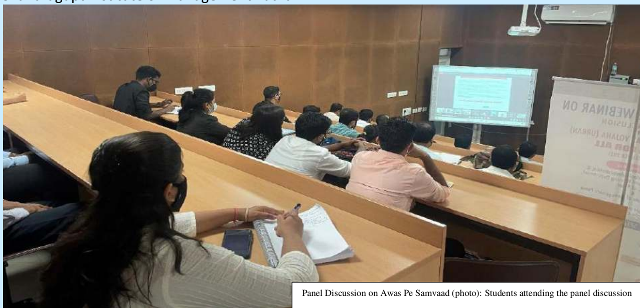
Panel Discussion on Awas Pe Samvaad (photo): Students attending the panel discussion

A panel discussion on the “Role of Banks, Housing Finance Companies (HFCs) and Micro-Finance Institutions (MFIs) in facilitating access to finance for urban poor in all verticals of PMAY(U)” under the theme "Awas par Samvaad" under Pradhan Mantri Awas Yojana (Urban) [PMAY-U] was organized on 25 th September 2021. The event was jointly organized by the Directorate of Municipal Administration, Department of Urban Development and Housing, Government of Bihar and Chandragupt Institute of Management Patna.