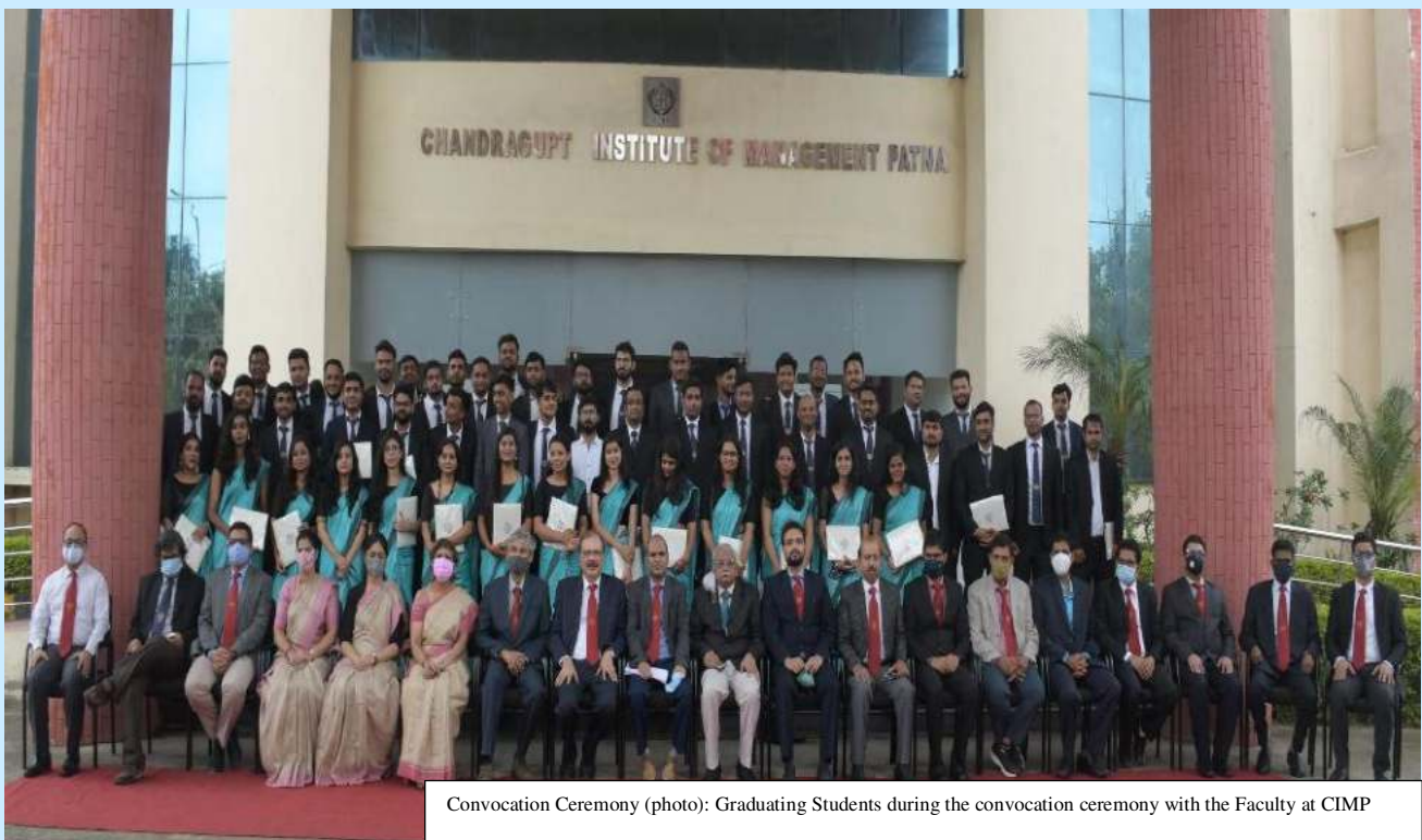
Convocation Ceremony (photo): Graduating Students during the convocation ceremony with the Faculty at CIMP