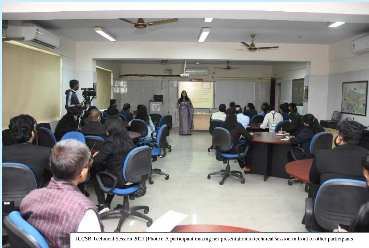
ICCSR Technical Session 2021 (Photo): A participant making her presentation in technical session in front of other participants