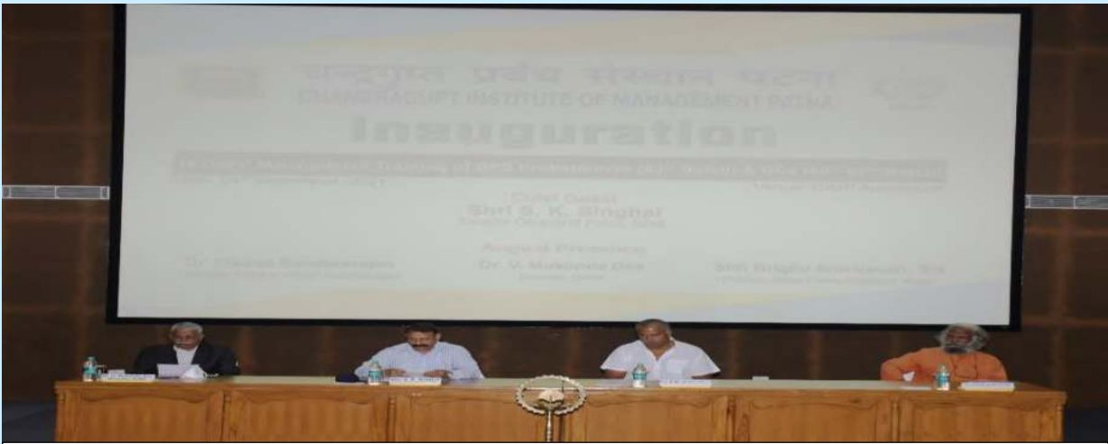
16-Days training programme for the Dy.SP Probationers (63rd Batch) and District Commandants (60th-62nd Batch) of Bihar Police Service Photo: Inaugural ceremony, CIMP

A 16-Days training program for the Dy. SP Probationers (63rd Batch) and District Commandants (60th-62nd Batch) of Bihar Police Service was conducted from 4 th September 2021 to 24 th September 2021 at CIMP. Nine participants attended the training, and were introduced to management concepts that comprised of basic management skills with some related situational case studies related to the police department.