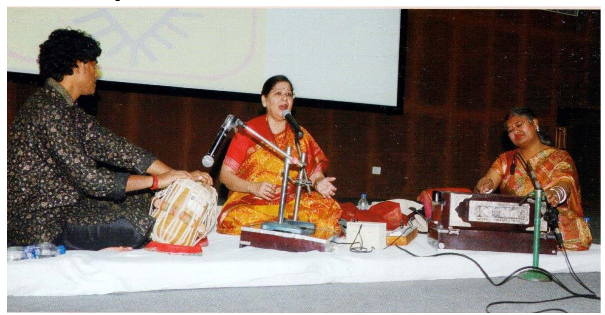
The Society for the Promotion of Indian Classical Music And Culture Amongst Youth (SPIC MACAY) is a