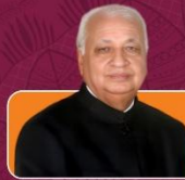
CHIEF GUEST SHRI ARIF MOHAMMAD KHAN Hon'ble Governor Government of Bihar

सोमनाथ शोध केंद्र PUBLIC POLICY RESEARCH CENTRE