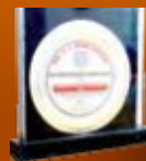
Dr. J.J. Irani Award Mumbai