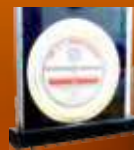
Dr. J.J. Irani Award Mumbai